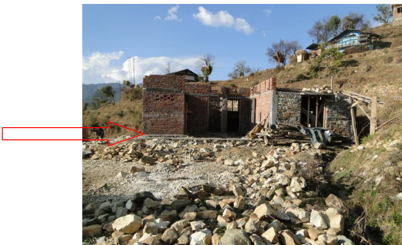
Close view of the propose site

General slope of the proposed site is 10°-15°, uphill slope trending 20°-25° and downhill slope is trending 15°-20° in south direction. At proposed site construction is taking place foundation and walls of house have been completed.